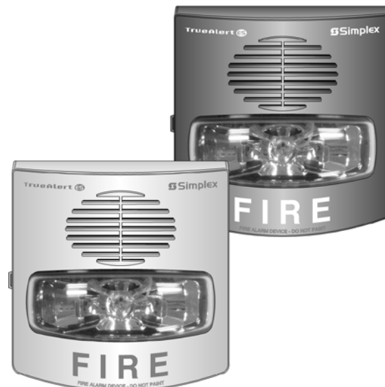
TrueAlert ES Addressable A/Vs are Available in Red with White Lettering and White with Red Lettering